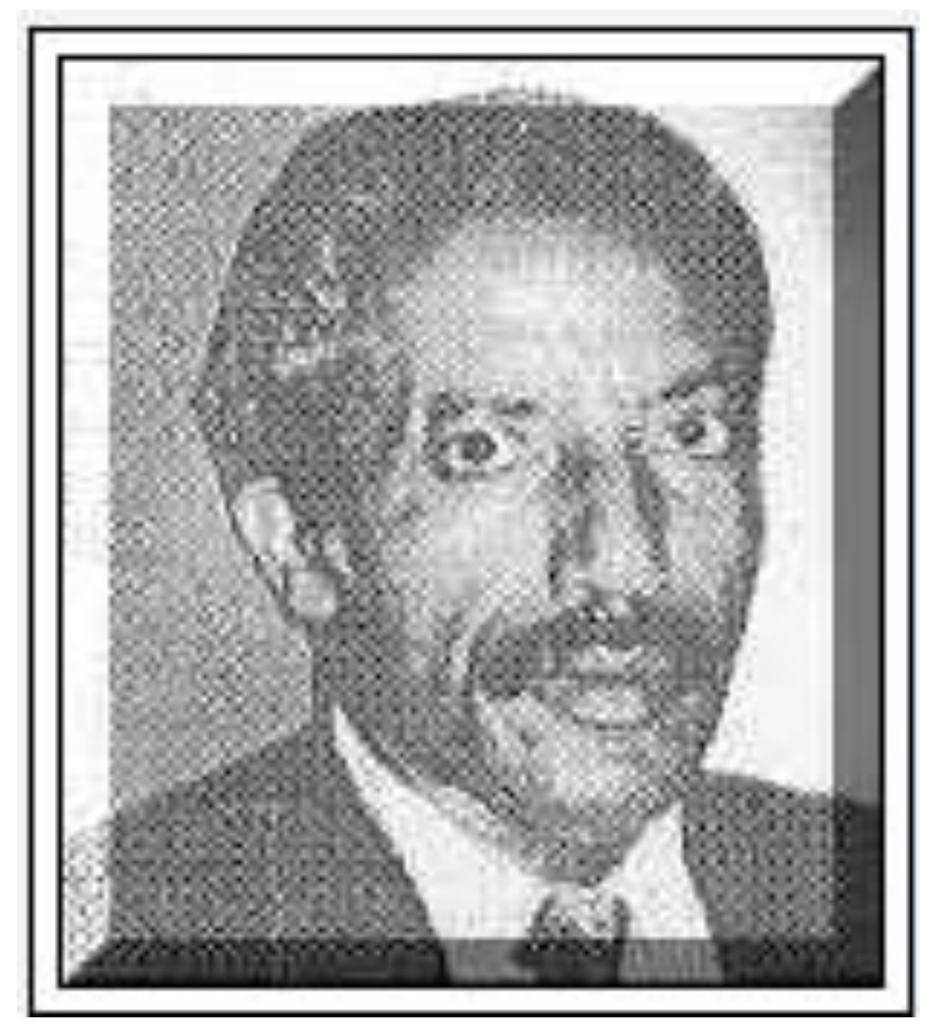
In Ethiopia, under iron fisted rule of Meles Zenawi, there are estimated 35,000 political prisoners and very many politcal dissidents have disappeared from the face of the earth!